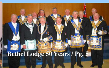
Bethel Lodge 50 Years / Pg. 5