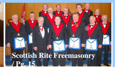
Scottish Rite Freemasonry / Pg. 15