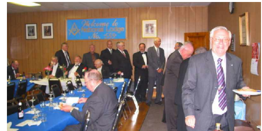
The Brethren enjoy one last banquet.