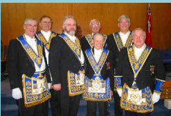
D.D.G.M. Official Visits / Pg. 6

A CALL TO GRAND LODGE ESPECIAL COMMUNICATION / Pg. 4