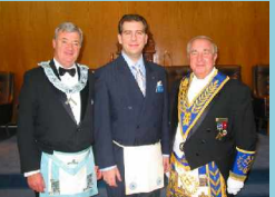
Congratulations & Best Wishes / Pgs. 8 & 9 Nickel & Friendship Lodge celebrate 50 Years of Friendship Pg. 10