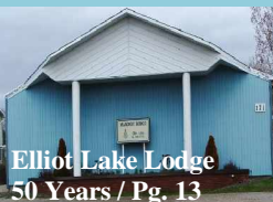
Elliot Lake Lodge 50 Years / Pg. 13