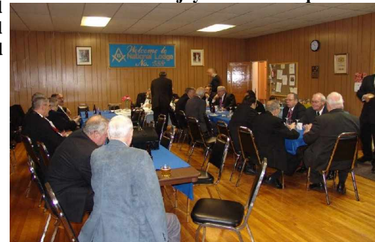
They may be leaving their old home but a new history now awaits them at Belrock Masonic Centre