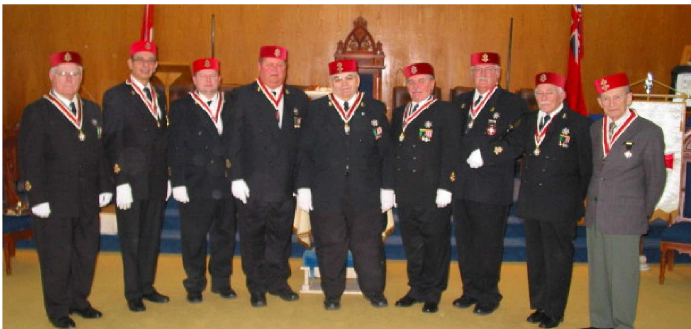
Mavar Preceptory No. 65 – Past Priors