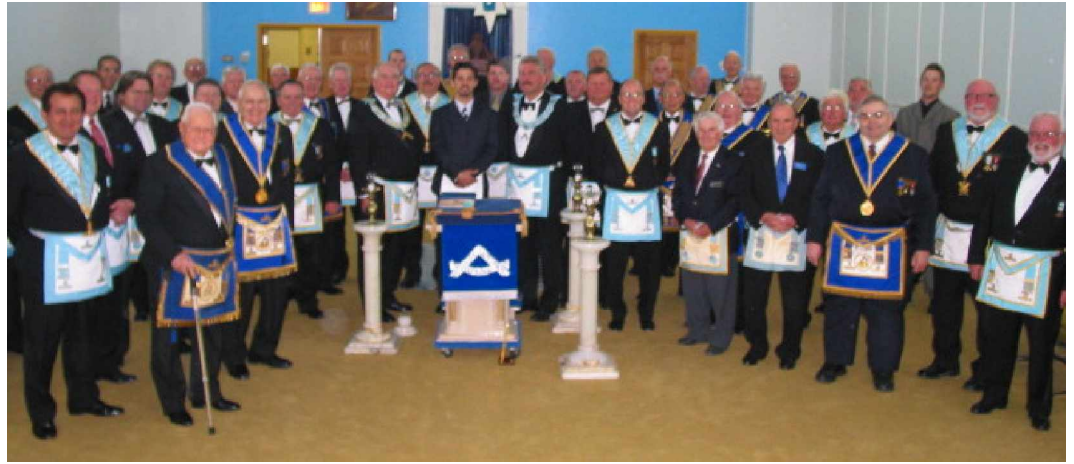
Members and Visitors present for the Nickel Lodge No. 427 meeting on Oct. 7, 2009