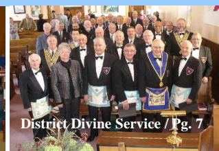
District Divine Service / Pg. 7