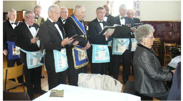
SUMANDIMAS sings praise