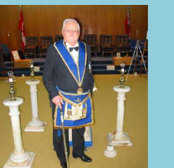
Biography of a quiet modest Mason / Pg. 11