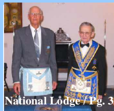
National Lodge / Pg. 3