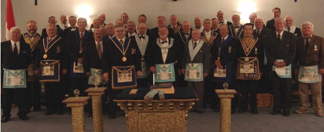
Many of the brethren from the Sudbury-Manitoulin District attended the special evening for National Lodge to bid a fond farewell to the old building and extend their best wishes to the brethren for their fresh start at Belrock.