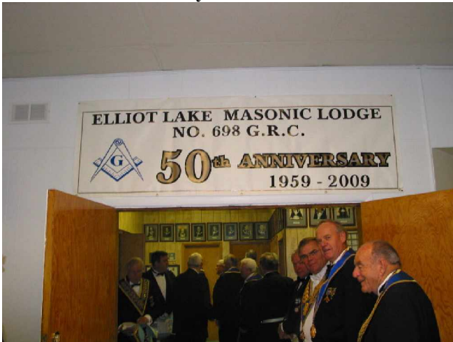
Entrance to Lodge anteroom

Elliot Lake Lodge located at 171 Spruce Avenue, Elliot Lake is an historic landmark in that town. It originally was a bunkhouse and entertainment centre for Uranium miners. It was eventually sold to the Masons in 1959.